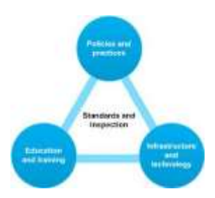
Ref: Safeguarding Children in a Digital World (Becta 2008)

This strategy is based on the BECTA PIES Model: